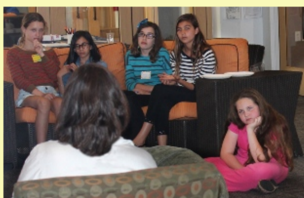
At the Osher Marin JCC, with some of the engaging teenagers in my identity workshop